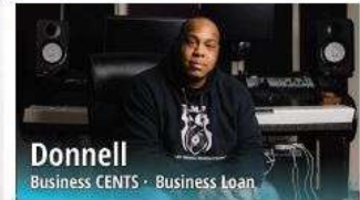
Donnell Business CENTS · Business Loan

LEARN MORE about our Community Programs by visiting alternatives.org