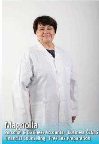
Magnolia Personal & Business Accounts · Business CENTS Financial Counseling · Free Tax Preparation