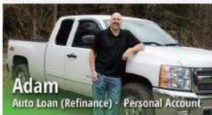
Adam Auto Loan (Refinance) · Personal Account